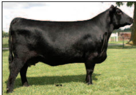
Craft Cheyenne 1397-581 Daughters sell as Lots 3 and 4. Maternal sister sells as Lot 1.