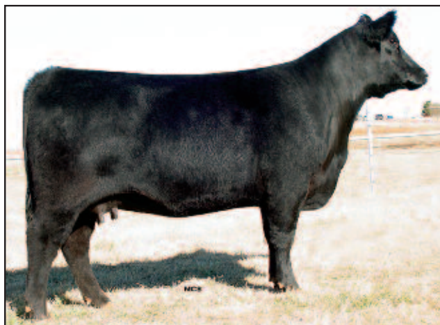
BAAR Pleasant Pill 1212 Dam of Lot 66