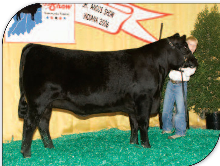
Grubbs Miss Countess 45 Maternal sister to Lot 18