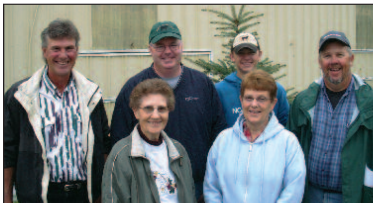
The Grubbs Family

• Bred A.I. 4/18/2011 to SS Incentive 9J17. Safe in calf.