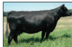
Wards Merle 293 Dam of Lot 10