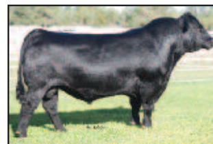
VAR Rocky 80029 A.I. service sire for Lot 3