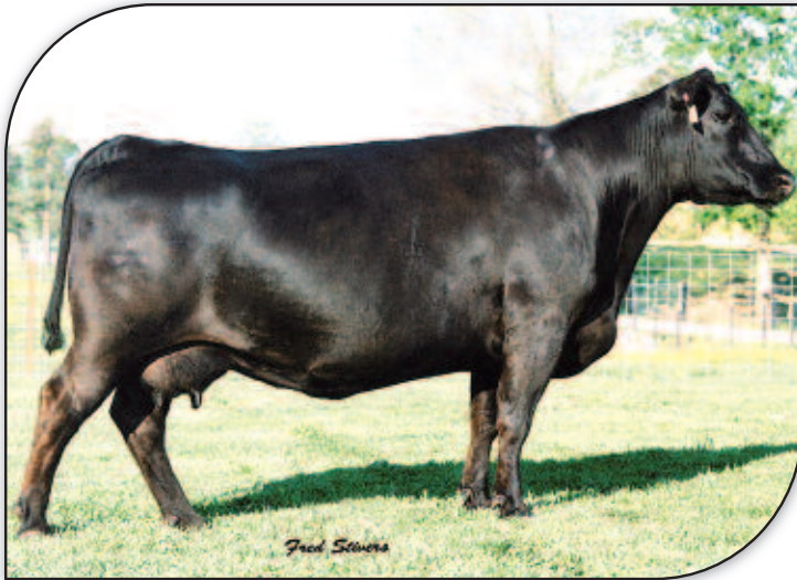
Sitz Everelda Entense 1137 Lot 29 descends from this Angus breed matriarch