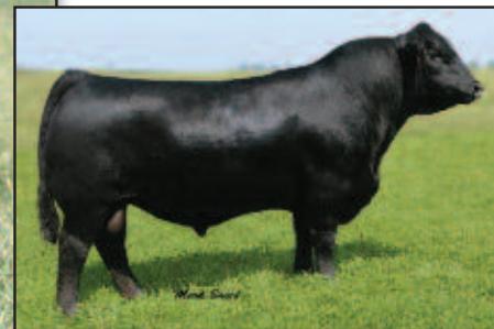
OSU Currency 8173 Sire of Lot 4