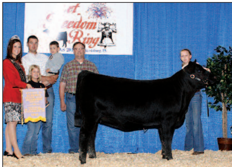
Champion Hill Cheyenne 7796 $22,500 half interest maternal sister to Lots 3 and 4