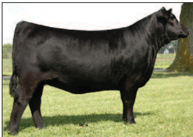
MCM Monica Cathy 872 Maternal sister to dam of Lot 16