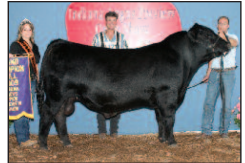
Grubbs Coupon 138 Grand Champion Bull, 2009 Indiana Angus Preview Show. Sold in the 2008 Genetic Opportunity.