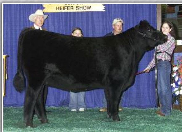
Roth Forever Lady 2610 $56,000 maternal sister to Lot 21 and to dam of Lot 22