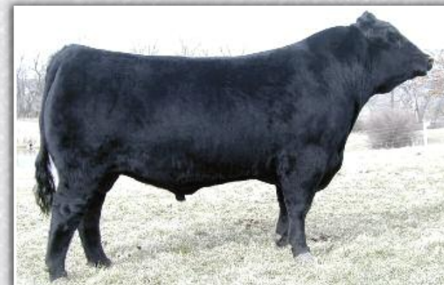
Dameron R&W New Deal 446 Descends from the same cow family as Lot 35