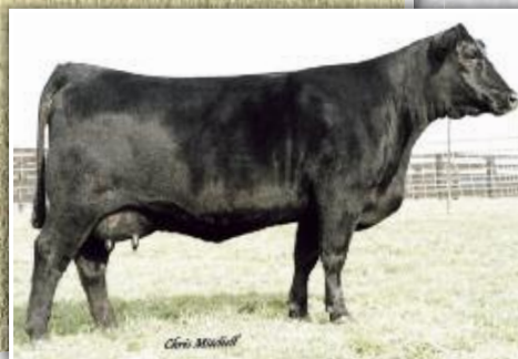
Shadybrook Ever Entense 491G $320,000 dam of Lot 1; maternal grandam of Lot 2