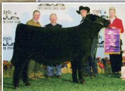
LaGrand Georgina 3171 Dam of Lot 16