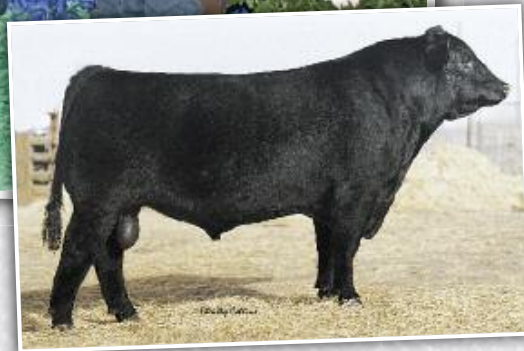
Famous 7001 Sire of Lot 14