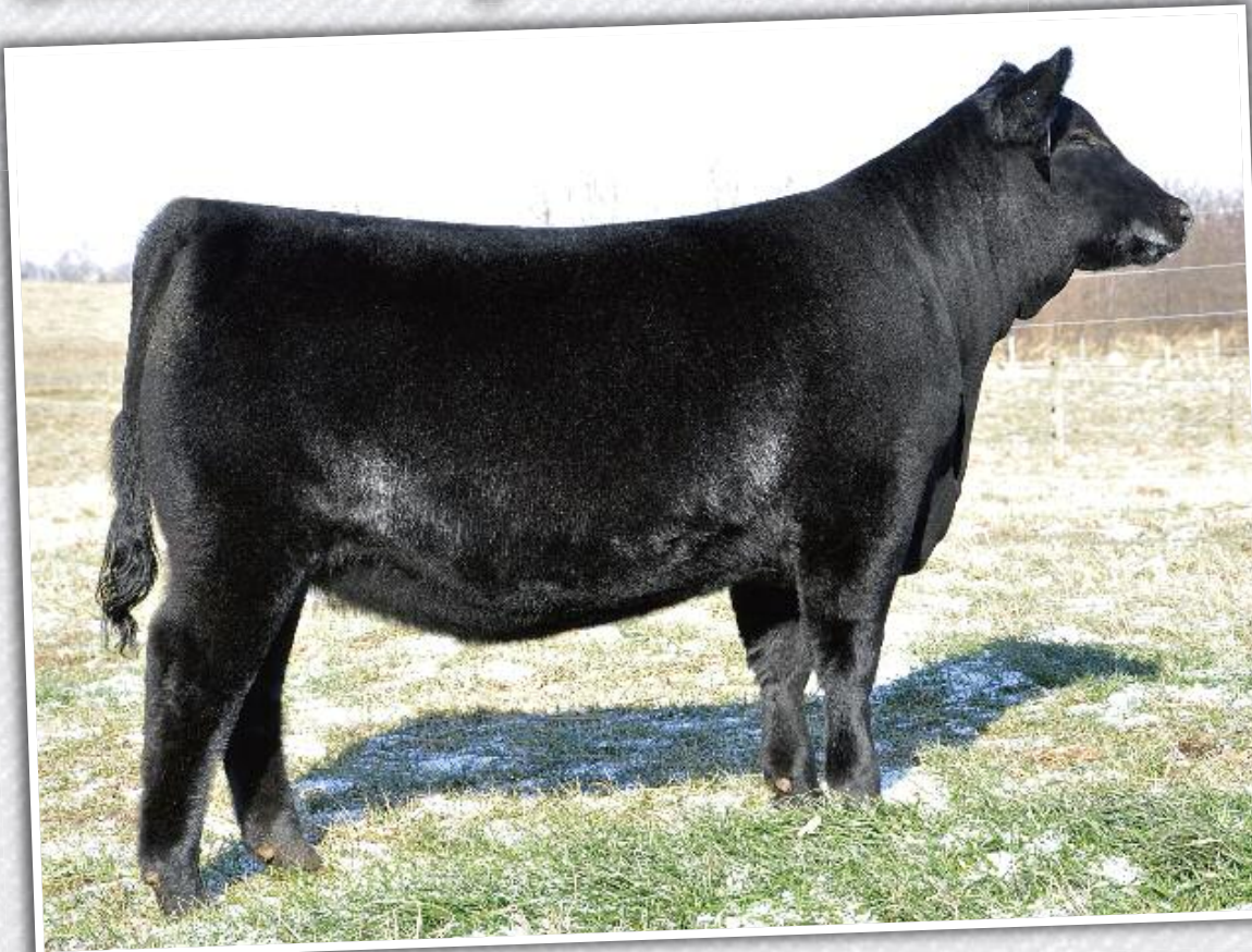
Dameron Bardot 9128 Lot 35