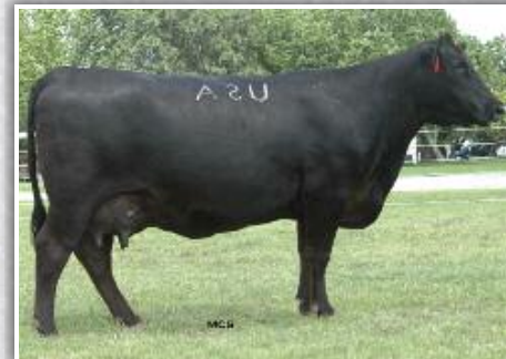
BAAR Lady Jaye 4020 $73,000 full sister to dam of Lot 8 pregnancy