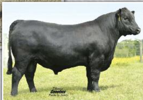
SQ Credence 67S Sire of Lots 6 and 8 pregnancies and Lots 7A-7B