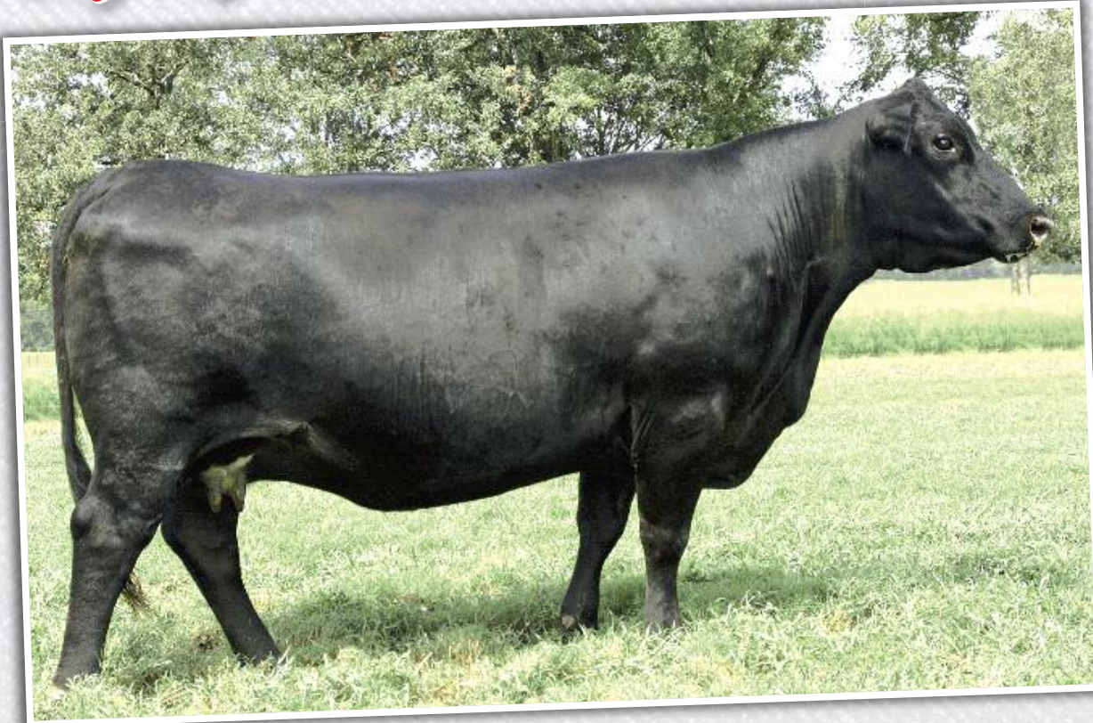
BAAR USA Lady Jaye 4007 Donor dam of Lot 8 pregnancy