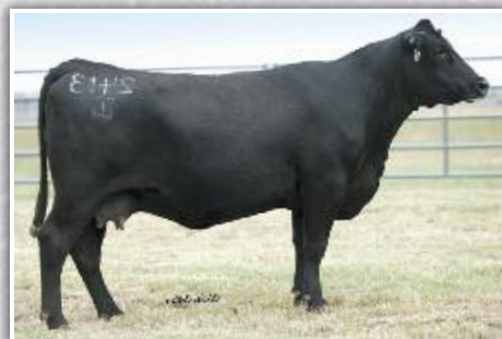
GAR 1407 New Design 2413 $200,000 full sister to dam of Lots 7A-7B

Offering choice of two direct daughters of this $660,000-valued donor. 1942 was recognized as the most proven Angus dam ever offered for sale at Three Trees Ranch. The first two natural progeny of this fantastic female balanced an average birth ratio of 96, an average weaning ratio of 106 and an average yearling ratio of 106. 1942 herself had an individual IMF ratio of 113 and has 43 progeny scanned with an average IMF ratio of 108 and an average URE ratio of 104. A flush sister to this female sold half interest for $190,000 to set a Missouri Angus record in the 2007 sale at Fox Run, with a full sister to her selling for $200,000 as the top selling cow of the 2007 sale at Gardiner Angus Ranch, where the first 12 daughters of this dynamic female sold for $261,500 as spring yearling females for an impressive average of $21,792. The dam of this dynamic female sold half interest for $135,000 as the top-valued female of the Sterling Hunter dispersal, and her long list of high-valued progeny include a maternal sister to this proven female who sold half interest for $144,000 as a spring heifer calf, continuing the tradition of the $400,000 grandam of 1942, GAR EXT 614, who produced the $610,000 record-selling spring yearling that rewrote Angus breed history in the 2007 sale at Deer Valley Farm in Tennessee. • Selling buyer's choice.