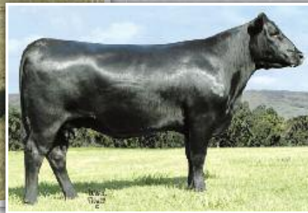
GAR New Design 1200 Maternal grandam of Lot 13 pregnancy