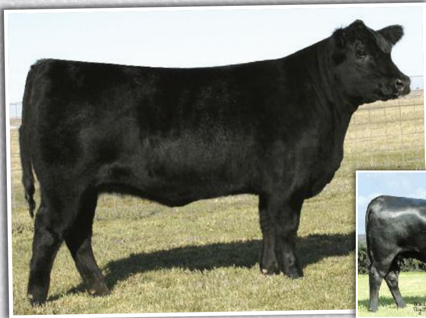
Riverbend Blackcap S705 Donor dam of Lot 13 pregnancy