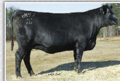
GAR Objective L196 $60,000 maternal sister to Lots 7A-7B