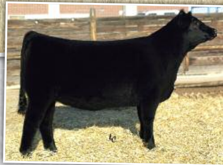
Plainview Pride J34

$30,000-valued daughter of C123 and maternal sister to Lot 39A embryos