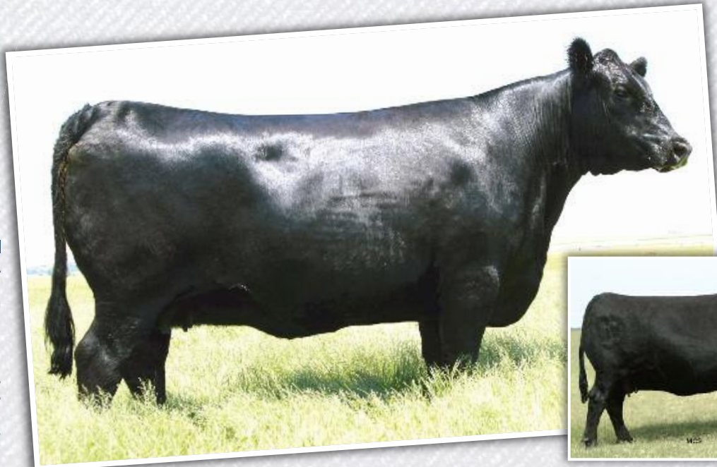
Riverbend Primrose 437 Lot 4

• LOT 4A: Heifer calf born 12/09/2009 by OCC Missing Link 830M. BW 80 pounds.