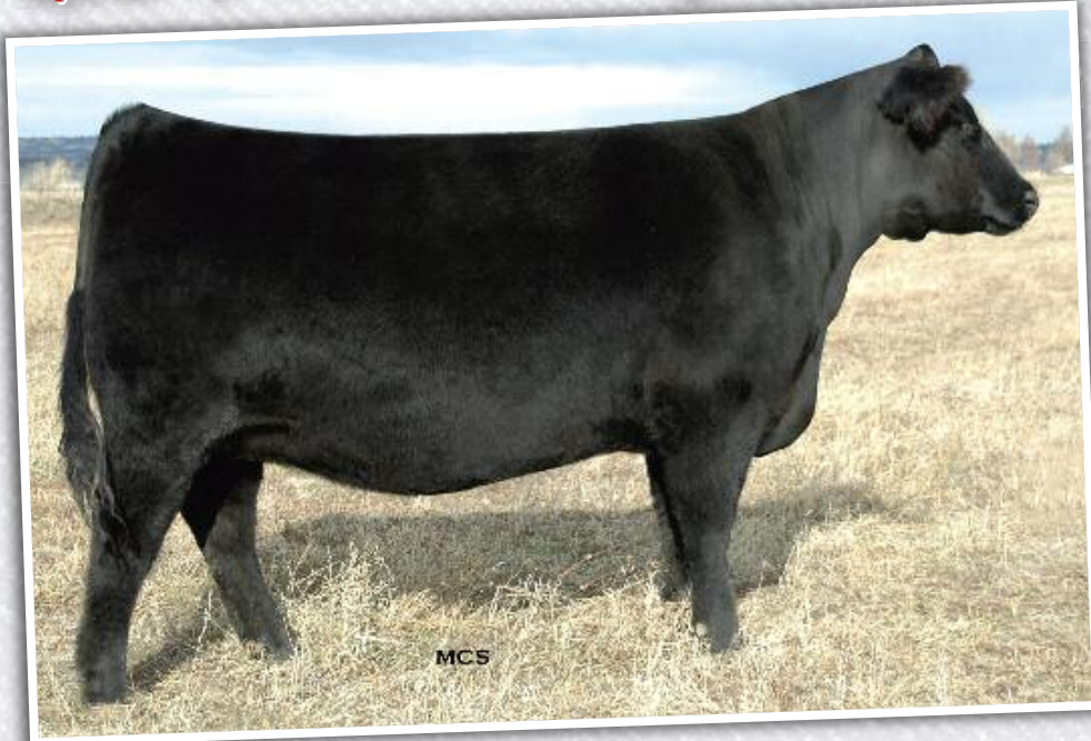
Greens Princess 8812 Lot 19