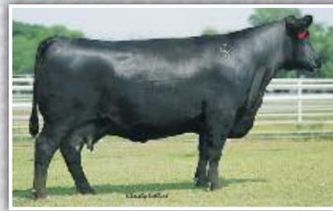
VAR Forever Lady 4304 Her descendants sell as Lots 23 and 24