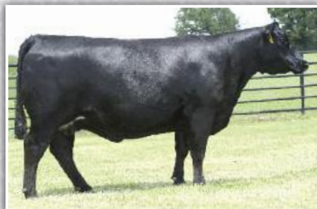
C&H Ever Entense 4038 $60,000 maternal sister to Lot 1