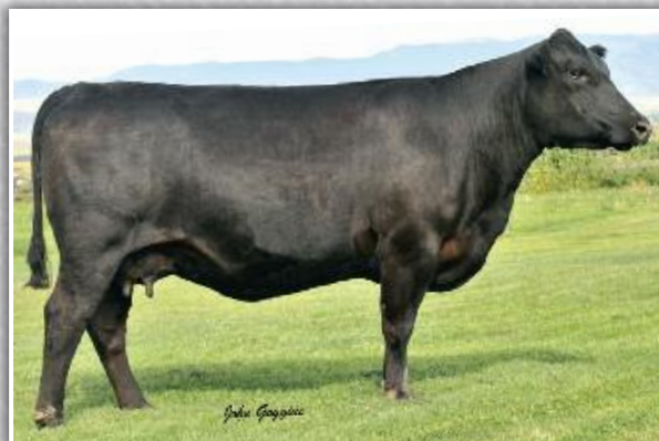
FV P512 of Ideal 4465

Maternal grandam of Lot 10 pregnancy and Lot 10A embryos