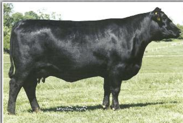
SVF Forever Lady 1120 Dam of Lot 38 flush donor