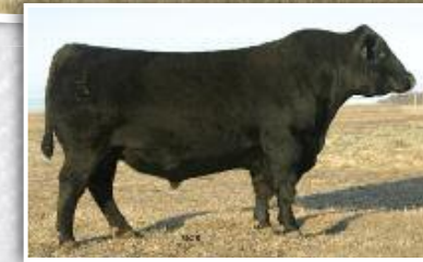
Rito Revenue 5M2 of 2536 Pre Sire of Lot 29