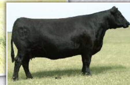
Double W Miss Primrose E64 $100,000 dam of Lot 4