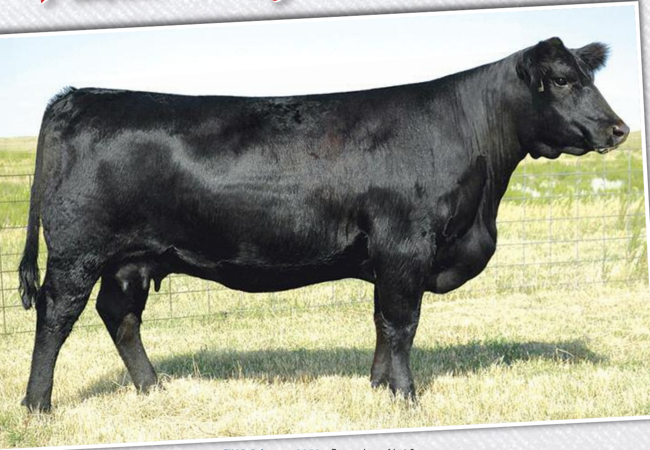
EXAR Primrose 2972 Donor dam of Lot 3 pregnancy