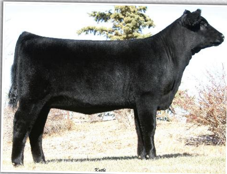
Lazy JB Blackcap Lassie 945 Lot 31