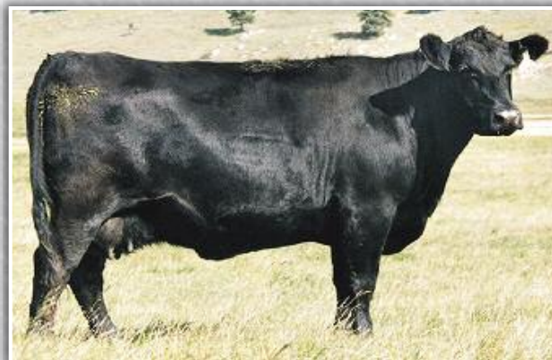
N Bar Primrose 2424 Maternal grandam of Lot 3 pregnancy and Lots 4 and 5