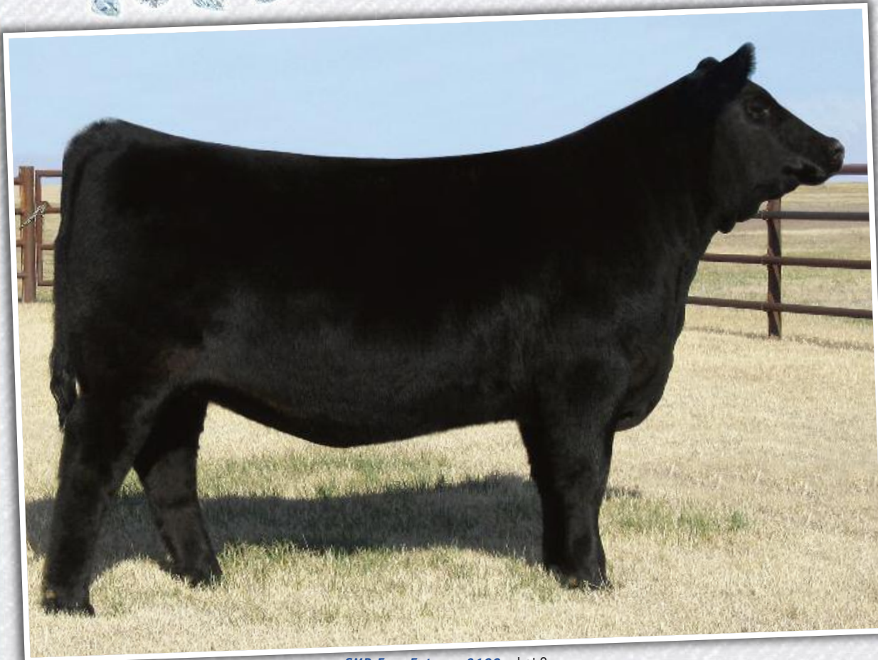
SMR Ever Entense 9100 Lot 2