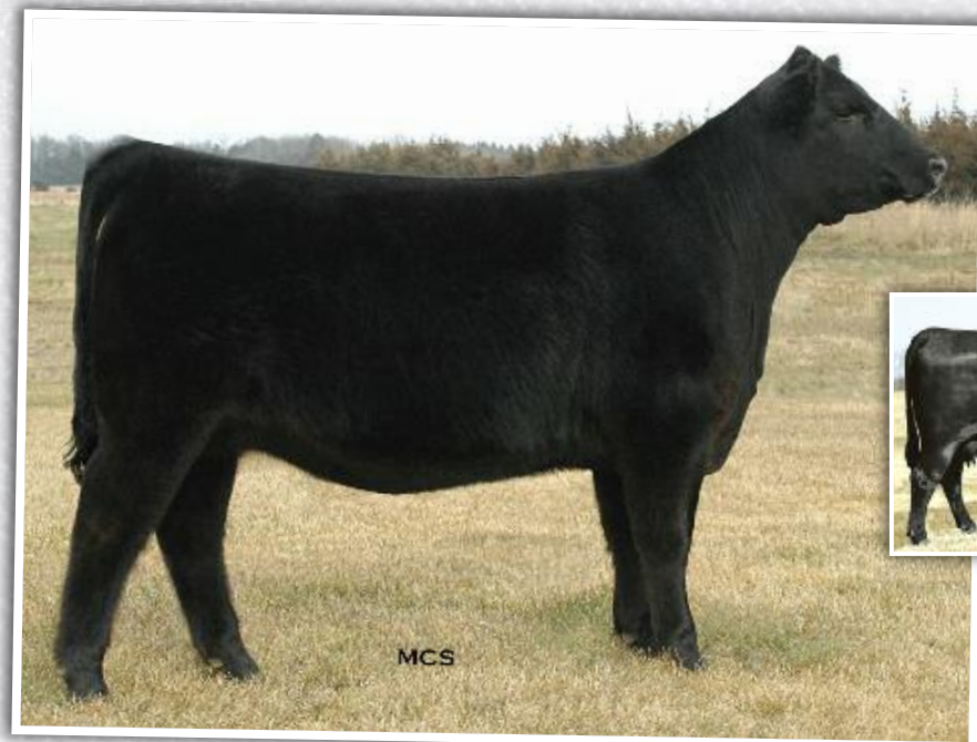
LaGrand Burgess 9195 Lot 26