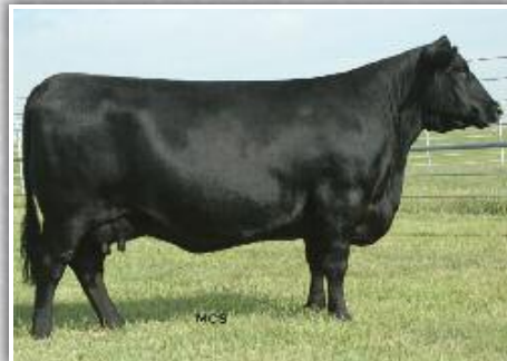
BAAR USA Lady Jaye 486 $100,000 full sister to dam of Lot 8 pregnancy