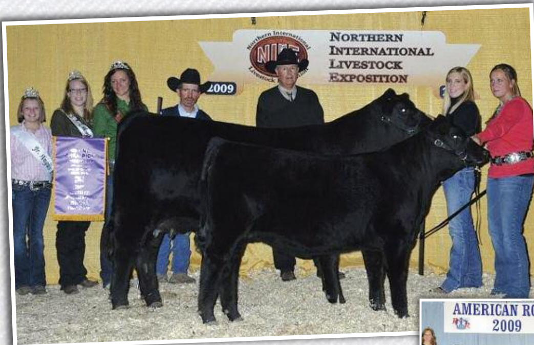
Greens Princess 7718 Lot 18 flush donor