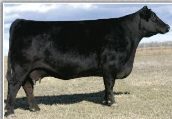
Greens Princess 7418

Dam of Lot 18 flush donor; maternal grandam of Lot 19; great-grandam of Lot 17