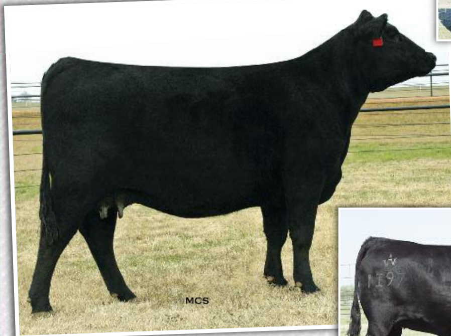
EXAR Rita 71599 $100,000-valued donor dam of Lot 11 pregnancy