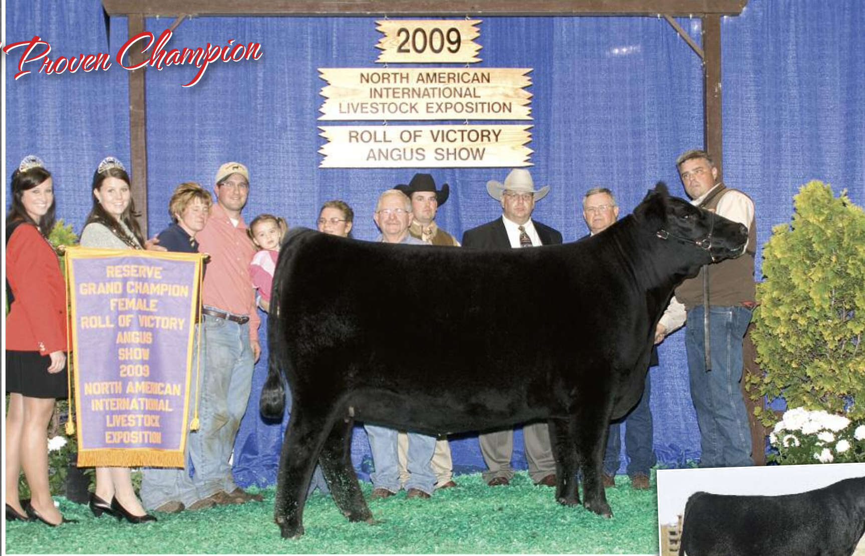
Dawson Ms Blackbird 28 Lot 14