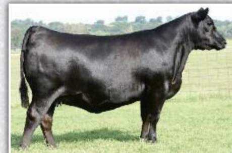
Limestone Ever Entense T797 $260,000 granddaughter of 491G