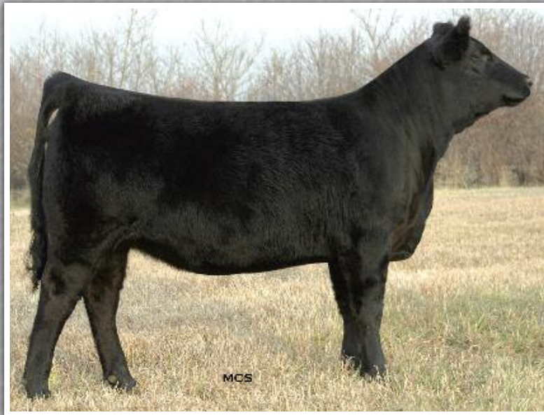
Rogens Forever Lady 984 Lot 23