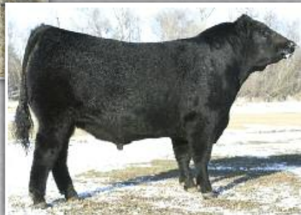
Plainview Lutton G35 "Johnny Ringo"

These two sons of the Lot 39B flush donor are full brothers to the Lot 39A embryos.