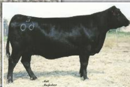
Double W Miss Primrose E60 Dam of Lot 5