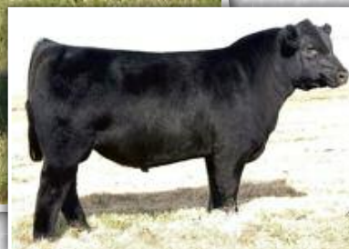
DCC 002 Outlook 472 Sire of Lot 21