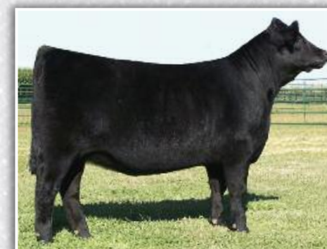
BAAR USA Lady Jaye 4006 $40,000 full sister to dam of Lot 9