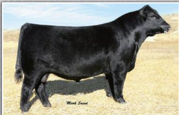
Connealy Final Product Sire of Lot 35