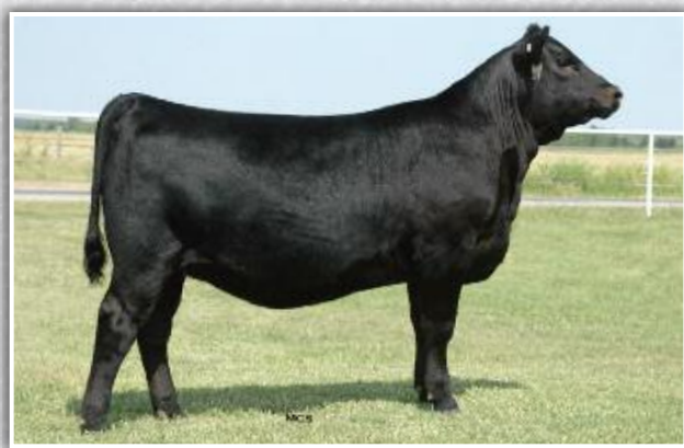
EXAR Rita 71600 $225,000 full sister to dam of Lot 11 pregnancy