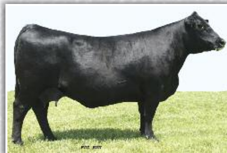
GAR 1407 New Design 1192 $190,000 half interest full sister to dam of Lots 7A-7B