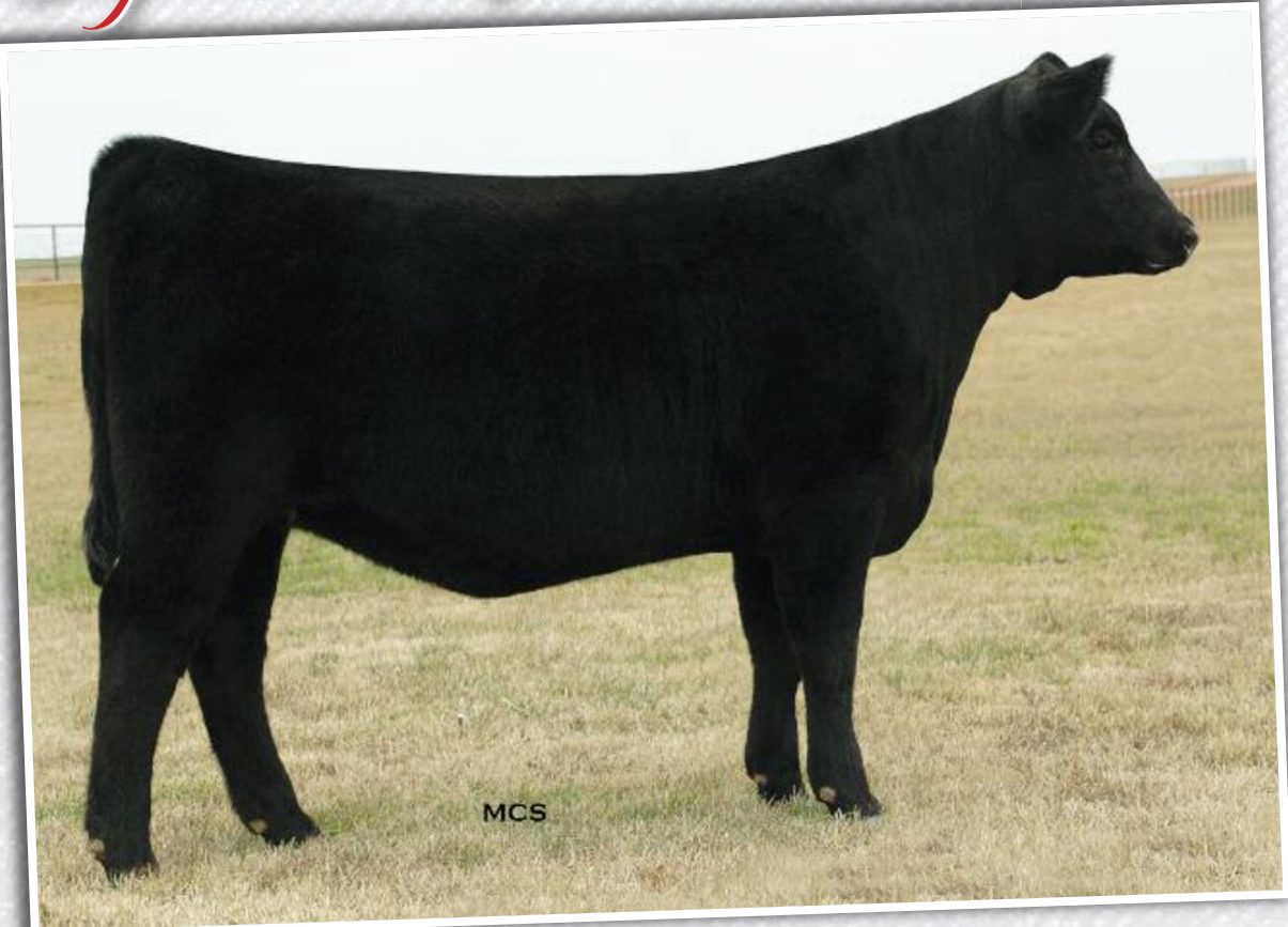
PF 410 Empress 9124 Lot 32