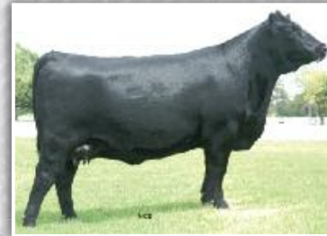
Forever Lady 5309 $95,000 maternal sister to dam of Lot 23