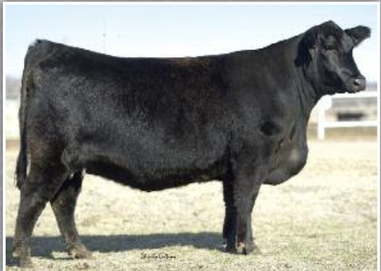
OSU Empress 5179 Dam of Lot 32