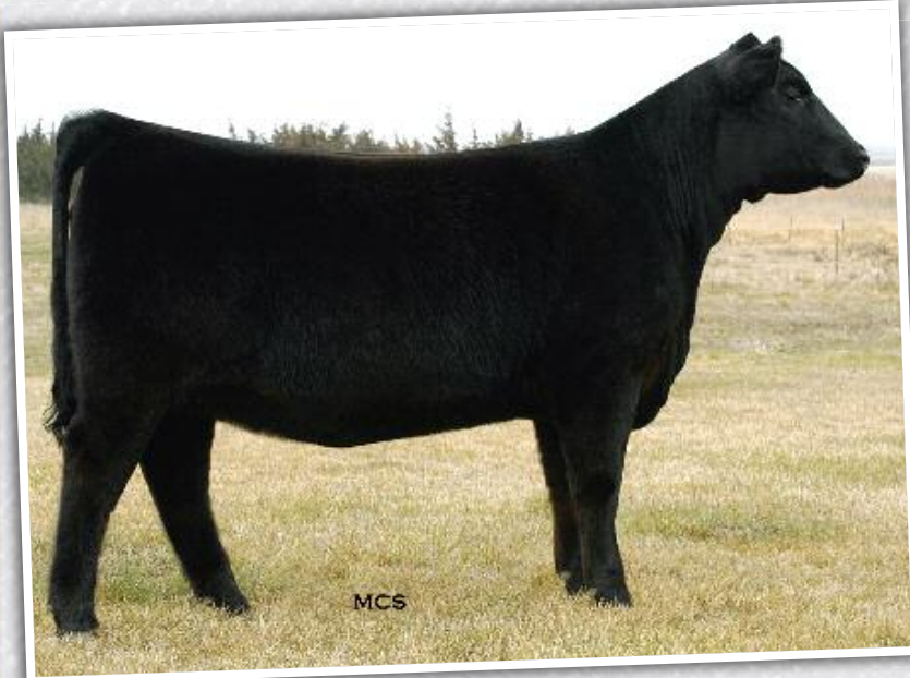
LaGrand Forever Lady 9090 Lot 24