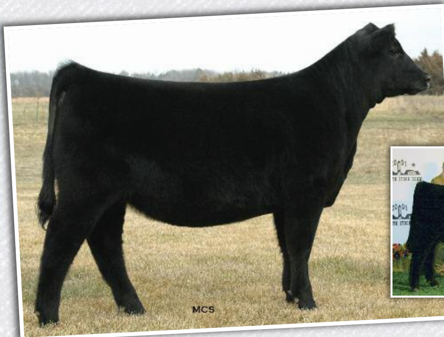
MAF Georgina of Tripp Lot 16