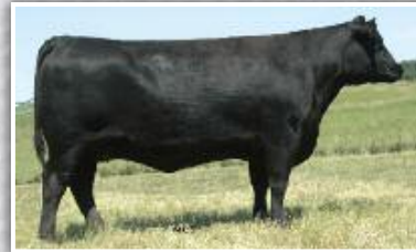
LaGrand Forever Lady 3139 Full sister to dam of Lot 23