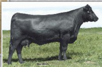
LLA Georgina 419 Maternal grandam of Lots 15 and 16