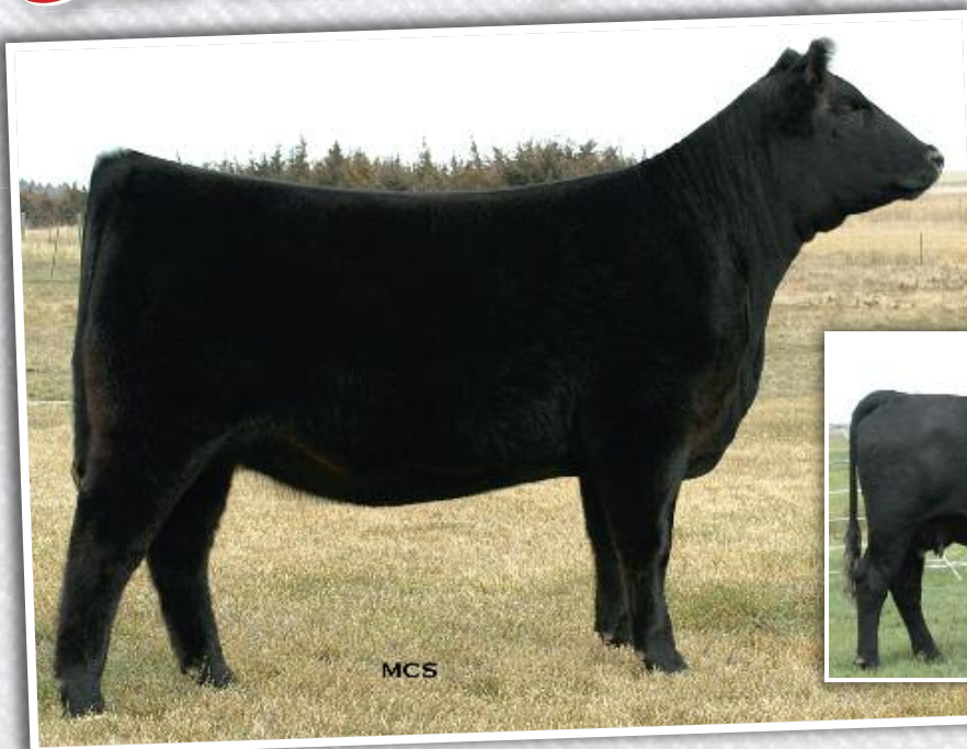
LaGrand Lena 9045 Lot 25