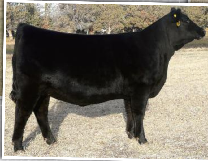
K Bar D Elaines Hot Gossip Lot 28