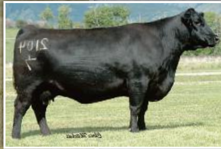
GAR EXT 2104 Maternal grandam of Lot 12