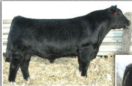
Plainview Lutton E102 "Lut"

$30,000-valued daughter of C123 and maternal sister to Lot 39A embryos