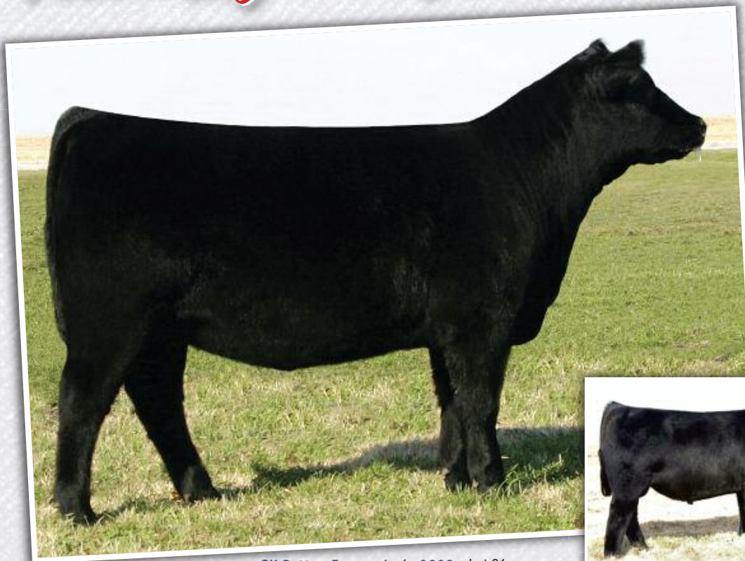
SK Patton Forever Lady 9020 Lot 21