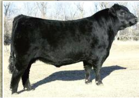
LaGrand PV Black Velvet 5103 Sire of Lot 30