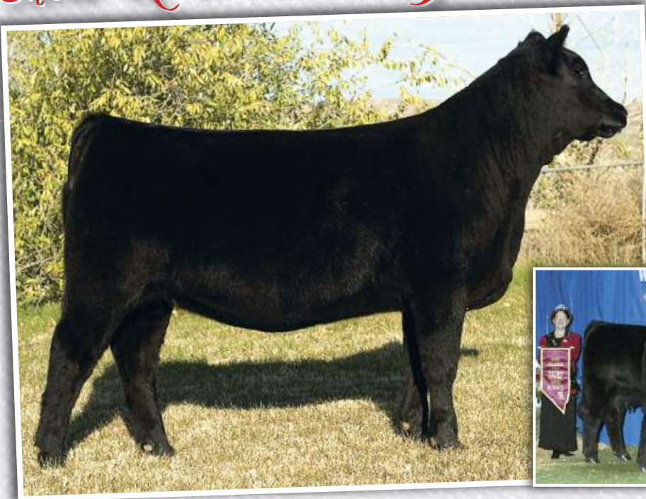
Malsons Sunset Galaxie 43W Lot 33