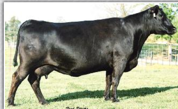
Sitz Everelda Entense 1137 Maternal grandam or great-grandam of Lots 1 and 2