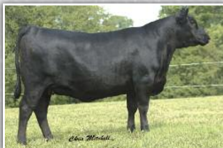
C&H Ever Entense 4036 $50,000 maternal sister to Lot 1