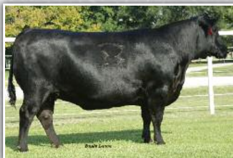
Basin Lucy 8N02 $400,000-valued full sister to dam of Lot 6 pregnancy