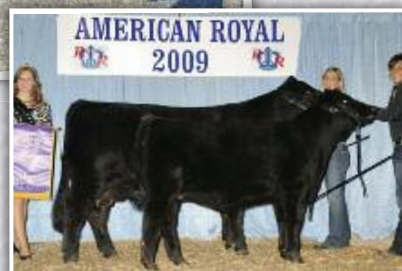
7718 as Champion Cow/Calf in Kansas City