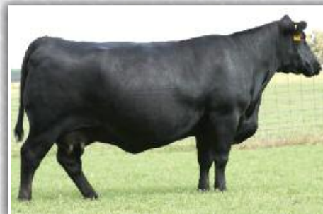
C&H Ever Entense 4047 $40,000 maternal sister to Lot 1