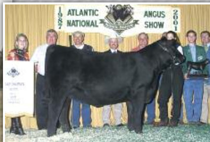
Champion Hill Georgina 1949 Dam of Lot 15