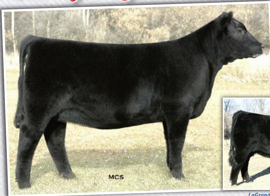
Styles Proud Lassie K53 Lot 30