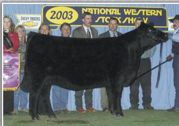
Greens Princess 1012

Dam of Lot 18 flush donor; maternal grandam of Lot 19; great-grandam of Lot 17