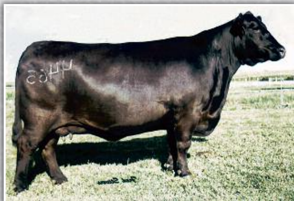
Ideal 4465 of 6807 4286

Maternal grandam of Lot 10 pregnancy and Lot 10A embryos