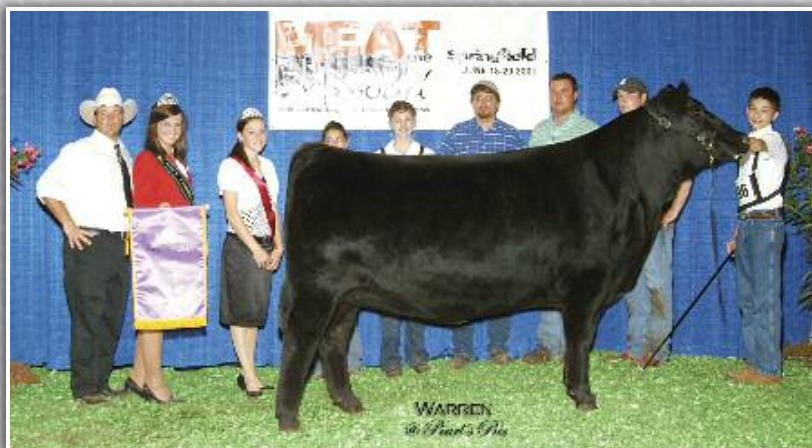
Moffitt Forever Lady M801 Full sister to Lot 22 pregnancy