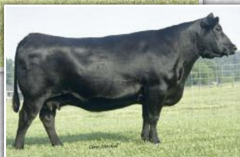
GAR EXT 614 $400,000 great-grandam of Lots 7A-7B