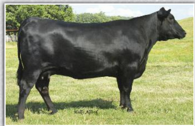
Rita 5M25 of 1197 Pred $100,000 full sister to dam of Lot 11 pregnancy