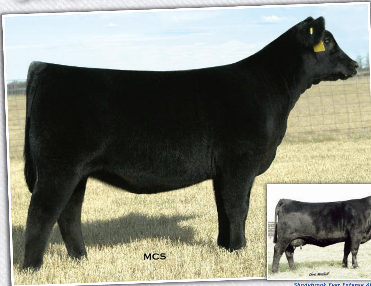
Limestone Ever Entense W753 Lot 1