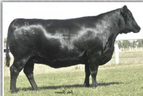
Basin Lucy 3807 $220,000-valued full sister to dam of Lot 6 pregnancy