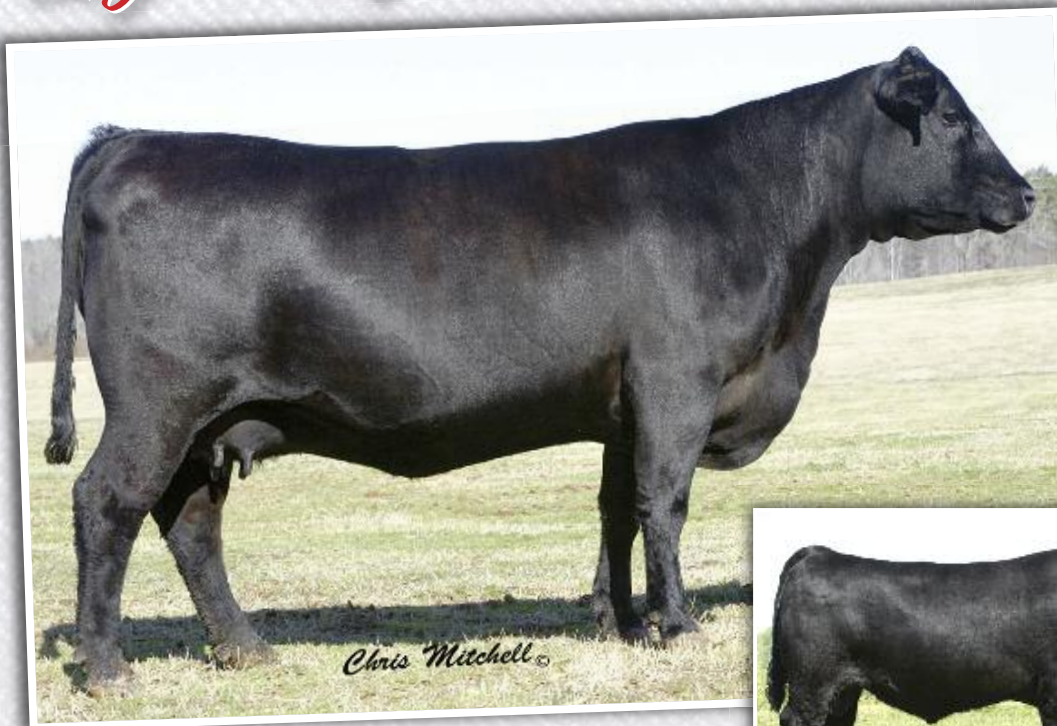
Three Trees First Lady 6108

Donor dam of Lot 10 pregnancy; full sister to dam of Lot 10A embryos