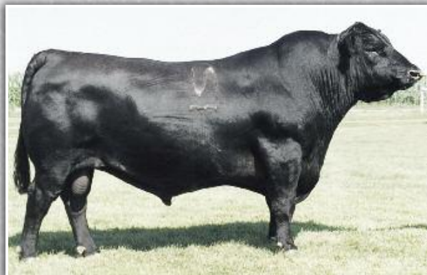
N Bar Emulation EXT Full brother to dam of Lot 3 pregnancy