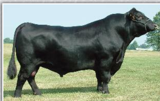
GAR Predestined Sire of Lot 9