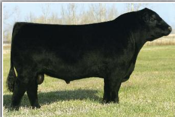
LaGrand MAF Antidote 5775 $28,000 son of Lot 38 flush donor