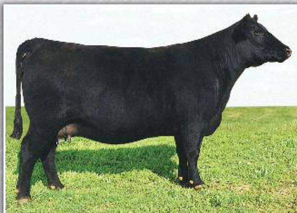
Bear Mtn Forever Lady 601 Dam of Lot 21 and maternal grandam of Lot 22