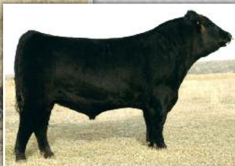
LCB Powerball 3106R Sire of Lot 36; maternal grandsire of Lot 37