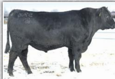
GAR Remedy Maternal brother to Lots 7A-7B