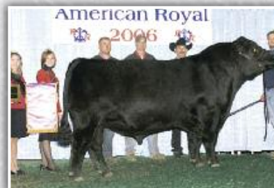
LaGrand Sun Dance 4211 Maternal brother to Lot 26