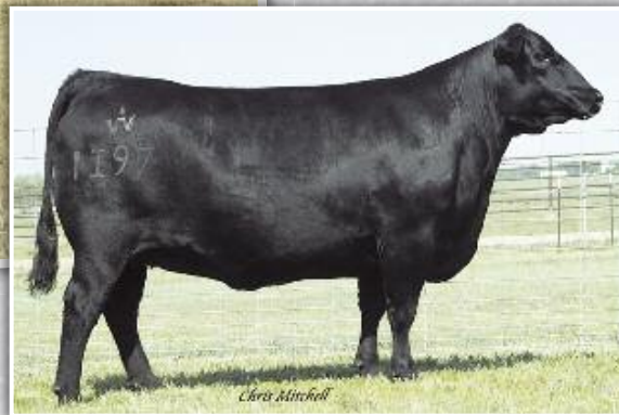
Rita 1197 of 2536 Rito 616 $800,000-valued maternal grandam of Lot 11 pregnancy