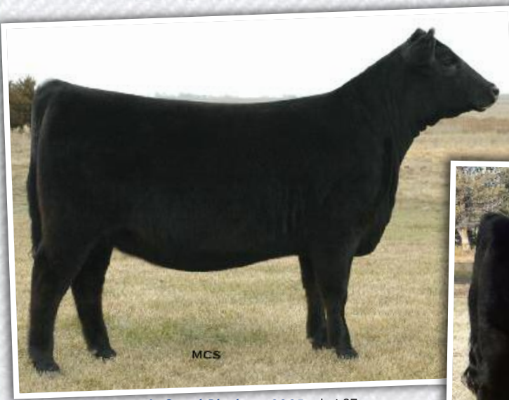
LaGrand Blackcap 9305 Lot 27