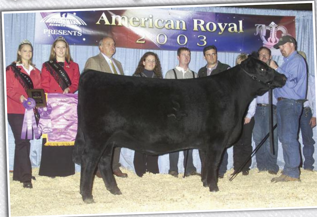
Roth Forever Lady 2706 Donor dam of Lot 22 pregnancy; maternal sister to Lot 21