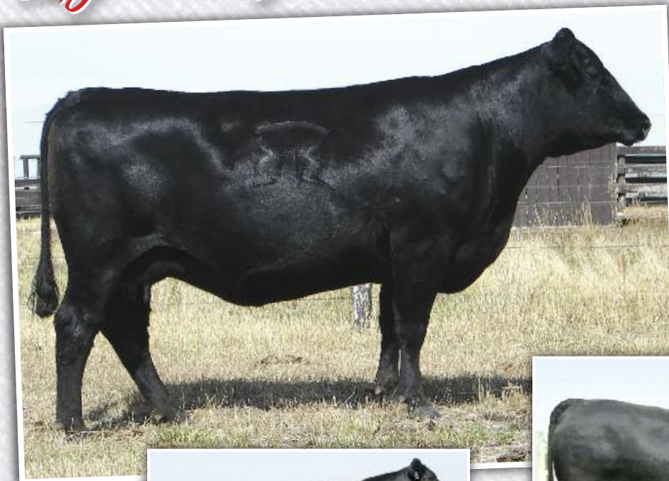
Basin Lucy 3823 Dam of Lot 6 pregnancy