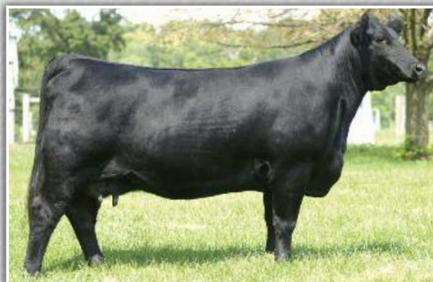
Dameron Bardot 689 Maternal sister to grandam of Lot 35