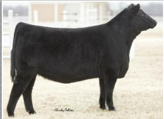
OSU Empress 8104 $7,500 maternal sister to Lot 32