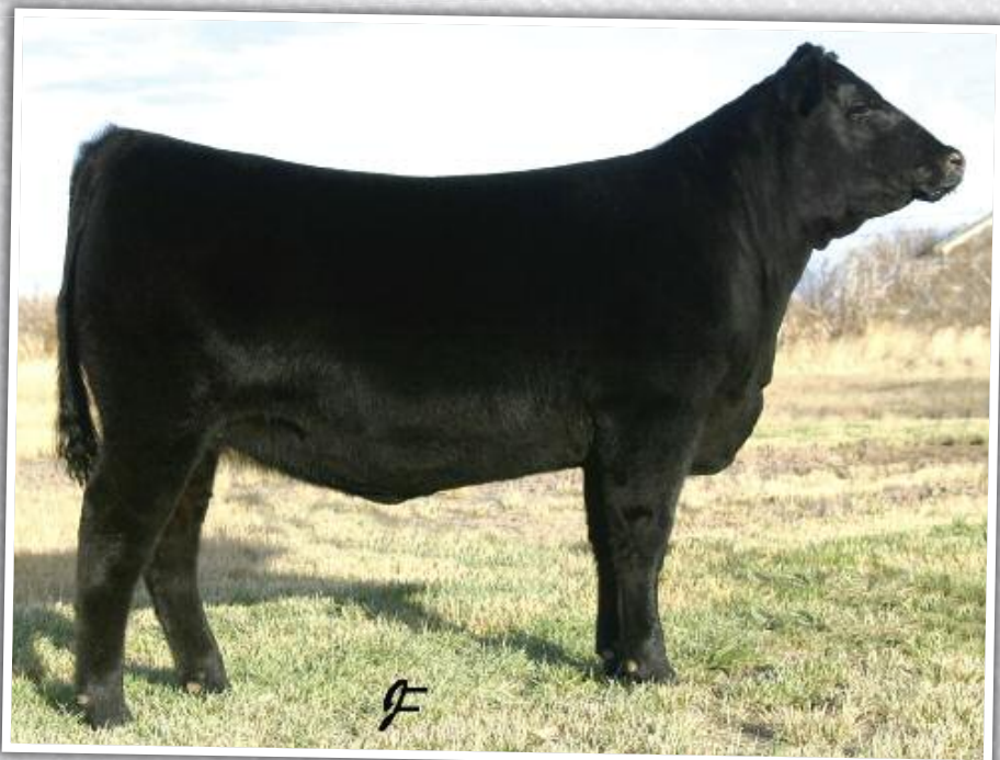
FF Fantasy W172 Lot 34

Lafins Galaxie 758 E Great-grandam of Lot 33