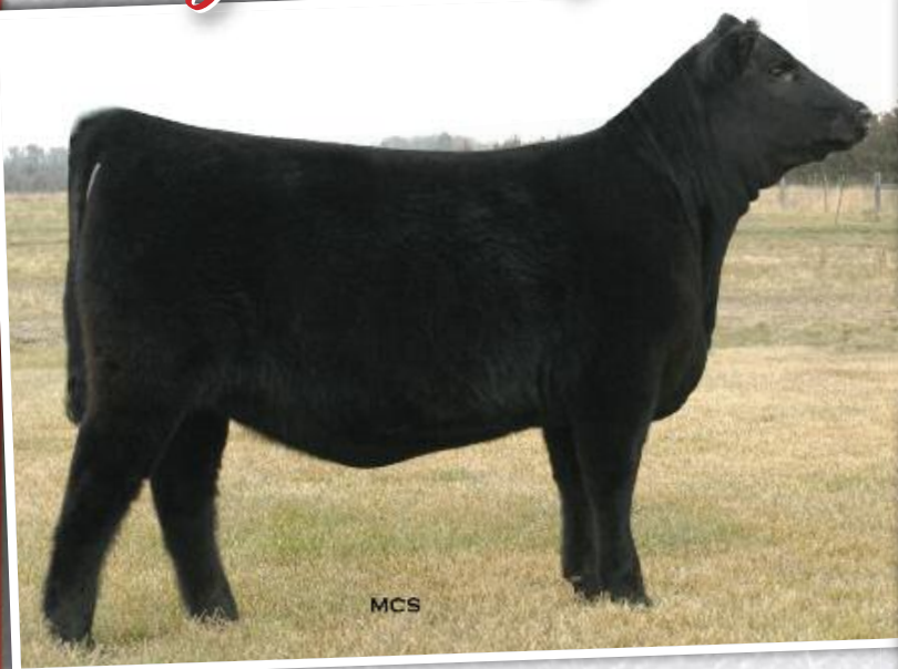
LaGrand Georgina 9263 Lot 15