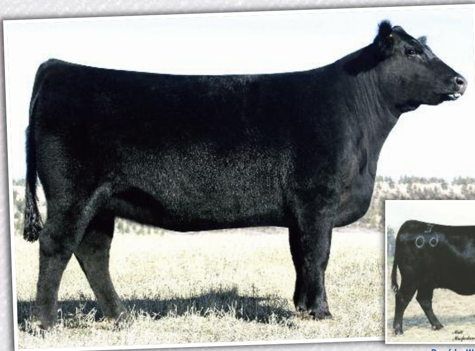
SMR Primrose 8046 Lot 5