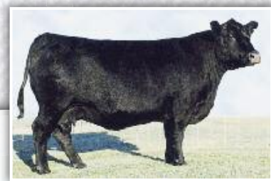
GAR Scotch Cap 867 Her descendants sell as Lots 11, 12 and 13