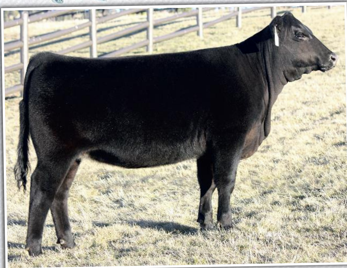
SMR Lady Jaye 9048 Lot 9