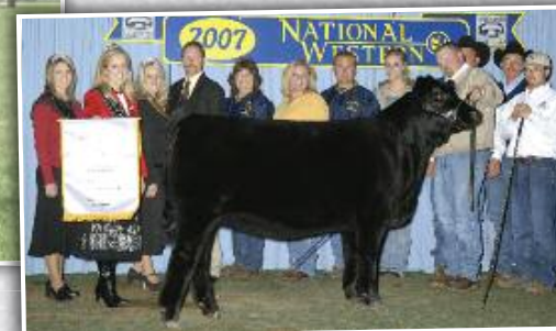
EXAR Princess 6414 Reserve Grand Champion Female, Denver 2007