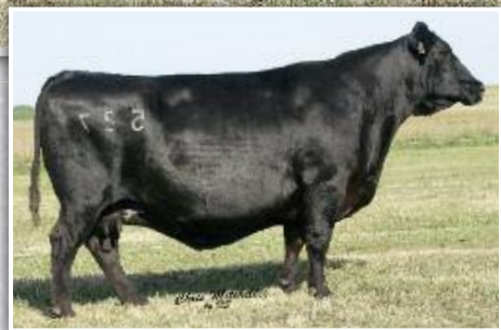
Basin Lucy 178E $410,000-valued maternal grandam of Lot 6 pregnancy