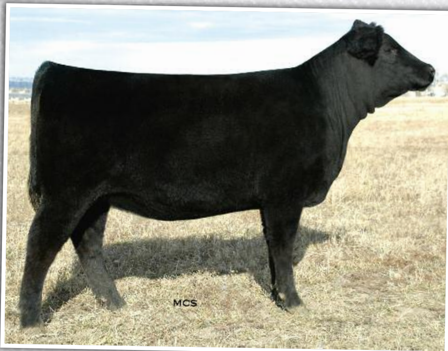
Greens Lassie 9701 Lot 37