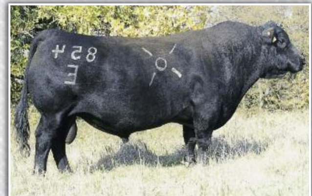
OCC Emblazon 854E Sire of Lot 3 pregnancy