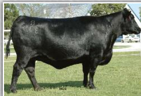
Basin Lucy 6433 $130,000-valued full sister to dam of Lot 6 pregnancy