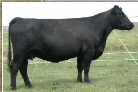
LaGrand Lena 4964 Maternal grandam of Lot 25