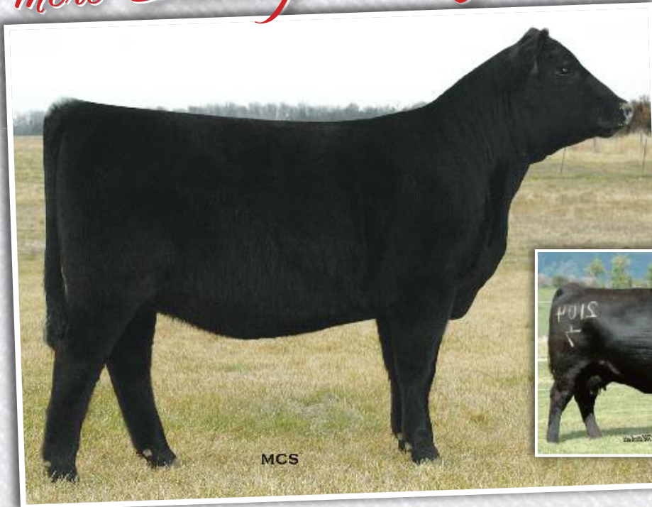
LaGrand Ms Precision 9360 Lot 12