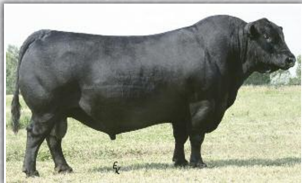
SAV Final Answer 0035 Sire of Lot 2 and Lots 25, 26 and 27