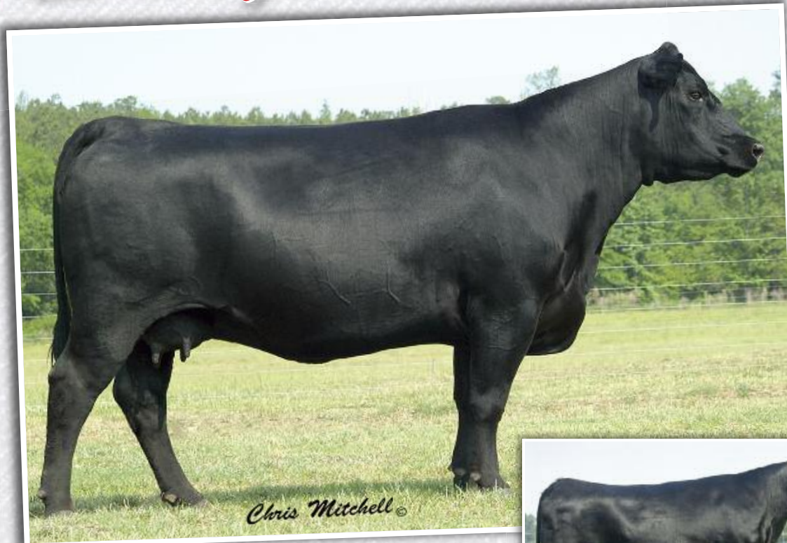
GAR 1407 New Design 1942 Donor dam of Lots 7A-7B