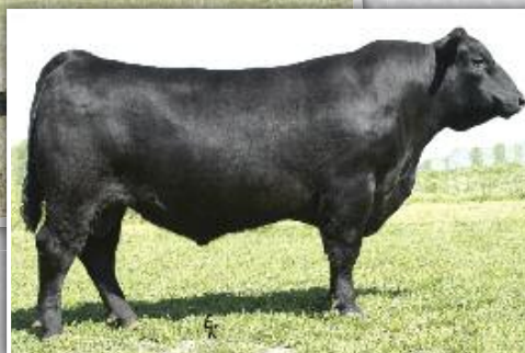
Sitz Upward 307R

Donor dam of Lot 10 pregnancy; full sister to dam of Lot 10A embryos