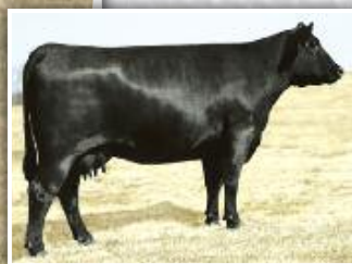
Partisover Burgess 616 Dam of Lot 26