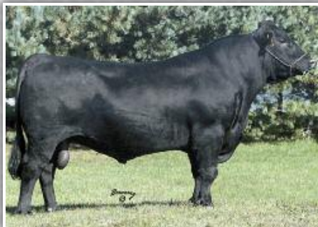
CRA Bextor 872 5205 608 Full brother to dam of Lot 8 pregnancy