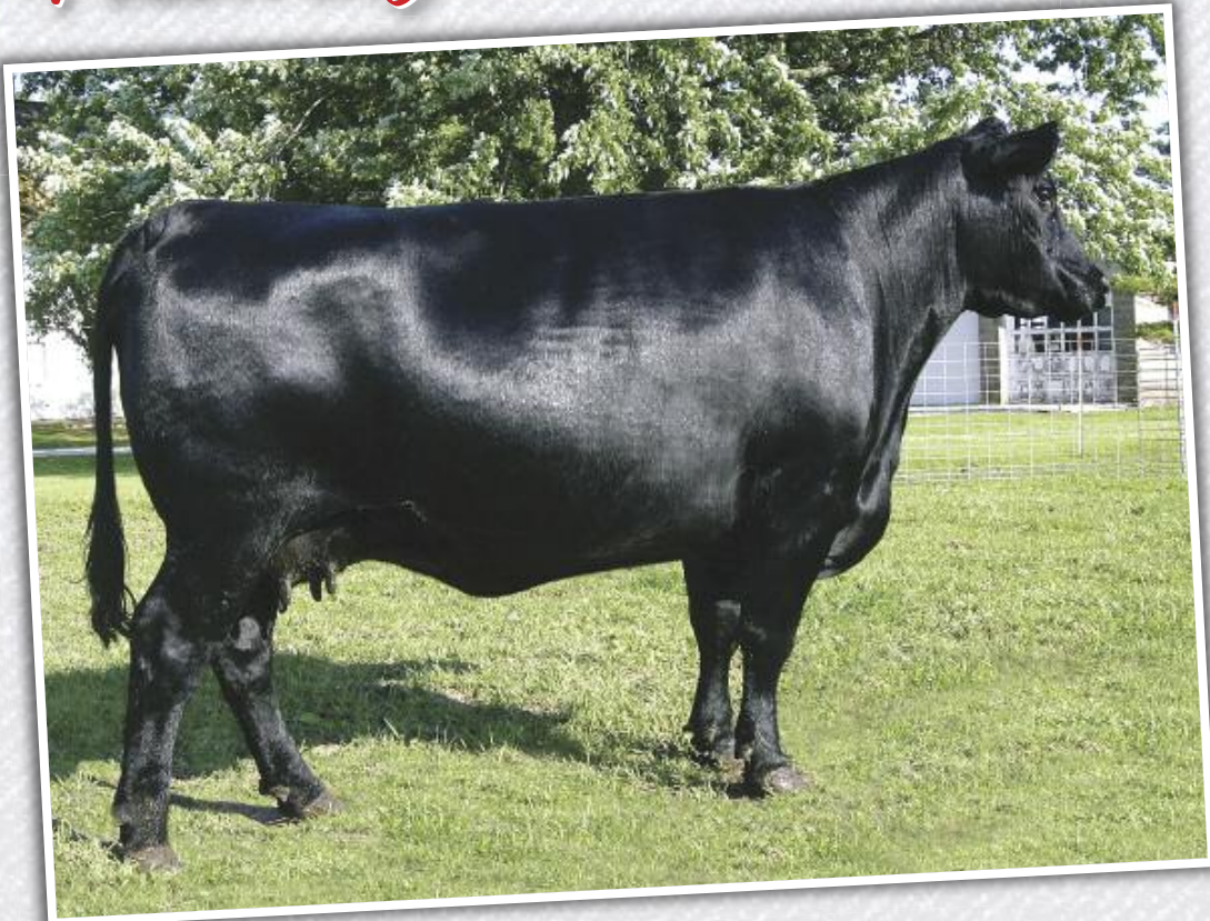
Maple Lane Forever Lady 277 Lot 38 flush donor