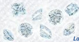
LaGrand Lass 9348 Lot 29