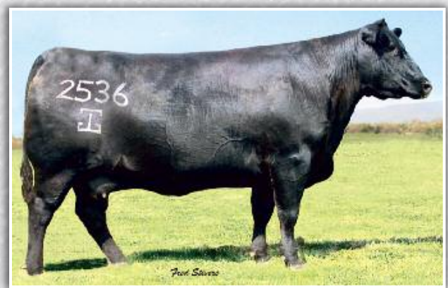
GAR Precision 2536 Great-grandam of Lots 11 and 13 pregnancies; full sister to dam of Lot 12