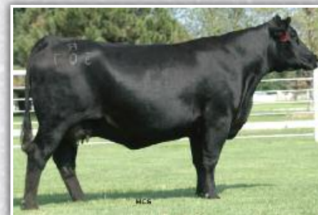
Basin Lucy 804N $362,000-valued maternal sister to dam of Lot 6 pregnancy