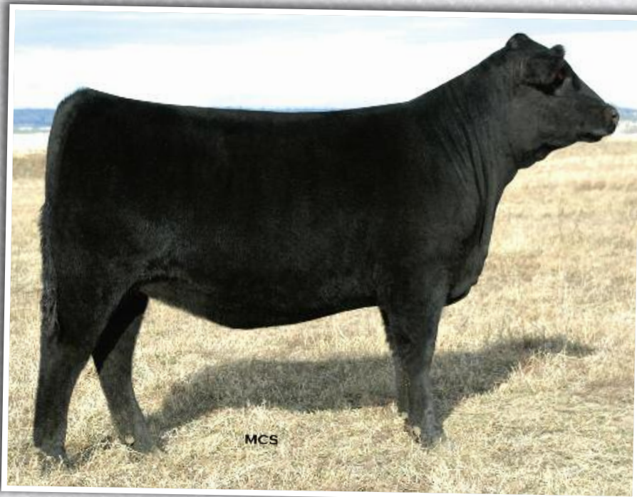
Greens Princess 9190 Lot 20