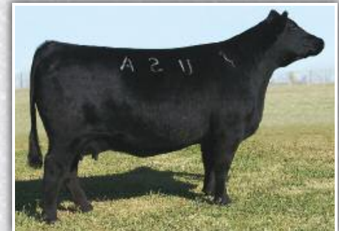
BAAR USA Lady Jaye 5086 $140,000 maternal sister to dam of Lot 8 pregnancy