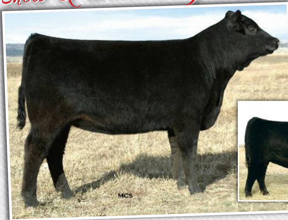
Greens Kate 9162 Lot 36